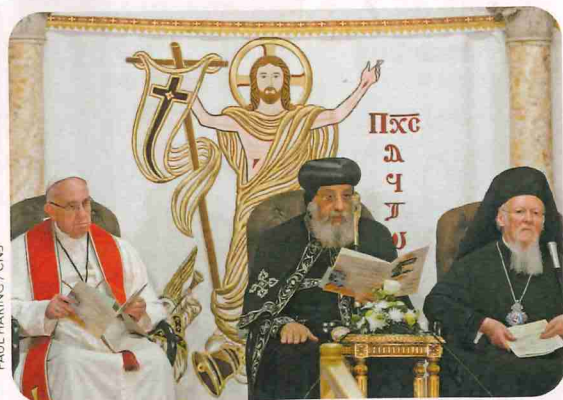
PAUL HARING / CNS