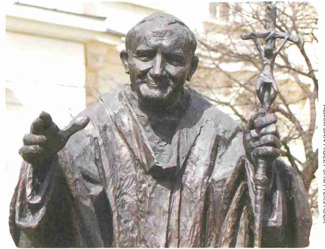
Sculpture of a smiling Pope St. John Paul II outside the Saint John the Baptist Cathedral in Trnava, Slovakia.

Saint Irenaeus (125–202) said that the glory of God is the human fully alive which reflects Jesus' own words, "I came so that they may have life; and have it more abundantly" (John 10:10). Saints enjoy life! The nearsighted St. Alphonsus Liguori (1696–1787), founder of the Redemptorists, sat in the back row of the Naples theater with his glasses off so he could enjoy the music he loved without the distraction of the half-naked chorus line. Saint Teresa of Ávila (1515–1582), caught devouring partridge in the convent kitchen, said, "When I pray, I pray; when I eat partridge, I eat partridge!" Saint Joan of Arc (1412–1431) loved horses, and St. Charles Borromeo (1538–1584) loved chess. Indeed, saints do smile. They even laugh. ●