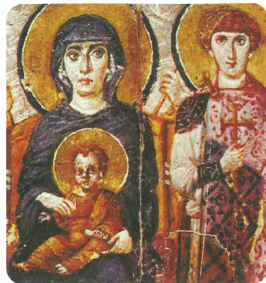
VIRGIN AND CHILD WITH ANGELS AND SAINTS

The first Christians did call Mary the “Mother of Jesus.” The title “Mother of God” wasn’t formally defined in the Church’s history until the First Council of Ephesus in 431. Around the year 250, the hymn Sub Tuum Presidium (“We Fly to Thy Patronage”) appeared, which refers to Mary as the Mother of God. Why did it take so long for the early Church to decide how to refer to Jesus’ Mother? What we call Mary is tied to how we understand Jesus’ identity as the fully human and fully divine Son of God. The Church understood Jesus as a person of the Trinity, the Son of God, who uniquely possesses both fully human and fully divine natures. In a nutshell, you can’t separate the “man” Jesus from the “God” Jesus. In clarifying what it meant to say that Jesus is the Son of God, equally one with the Father and the Holy Spirit and yet fully human and “like us in all things but sin,” the Church had to answer the question of how Mary fit into the work of salvation. Mary was the Mother of the Son of God; she was not only the Mother of Jesus’ human nature. When Catholics call Mary the “Mother of God,” they state their belief that Jesus is a single person—the Son of God—and that Mary is his Mother. ●